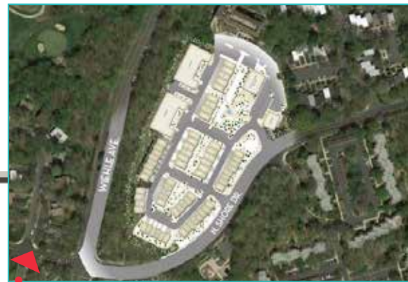
Tall Oaks Village Center 12040 North Shore Drive

Wiehle Avenue and North Shore Drive | Reston, VA 20190